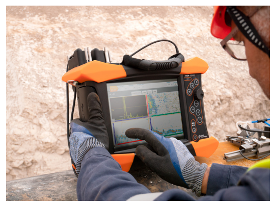
In-field inspection using M2M Gekko