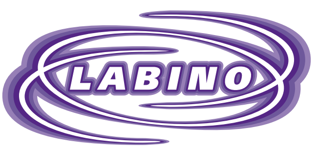
MAKES IT BRIGHT