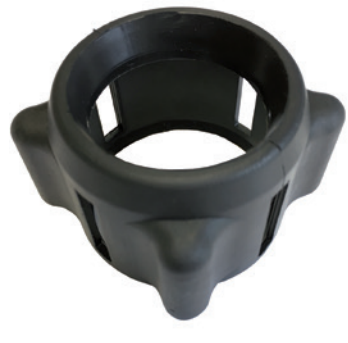
RUBBER BUMPER (P/N: F107)