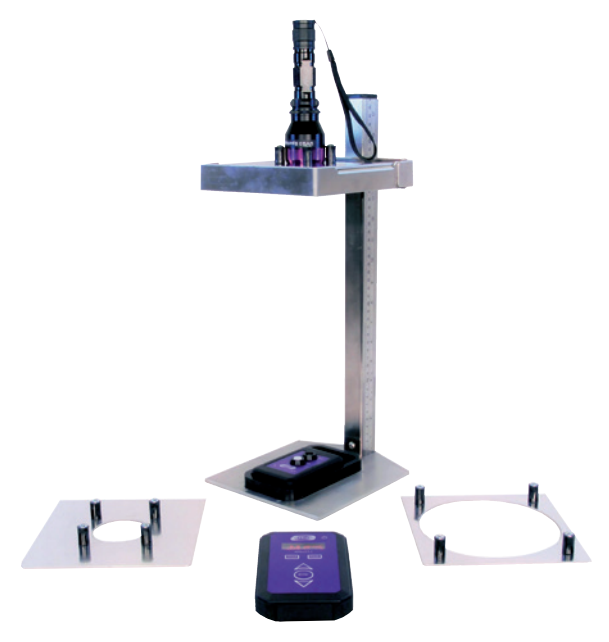
DAILY CHECKS CAN BE DONE WITH OLYMPOS MEASUREMENT STAND (P/N: A542)