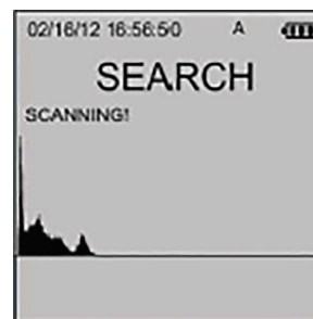
Real-time spectrum display