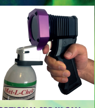
OPTIONAL SPRAY CAN HOLDER ACCESSORY "ATHENA" Athena mounts on the light and can fit ALL aerosol brands that are used in NDT. Buy it factory installed or add it later (PN: A503).