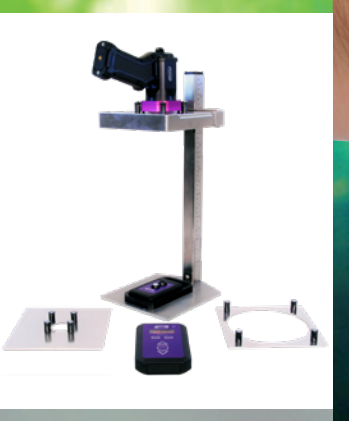
MEASUREMENT ACCESSORY "OLYMPOS" Your daily NADCAP and/ or ASTM E3022-18 checks can be carried out accurately with an Olympos stand (PN: A542) and an Apollo 2.0 dual meter (PN: M505).