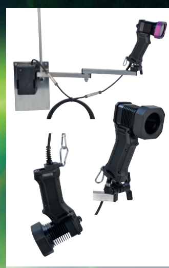
AC (MAINS) POWERED MODELS come with 8 ft (2.5 meter) cables but length can be customized. Add a Flexible arm accessory (PN: A538) near your mag bench for convenience.